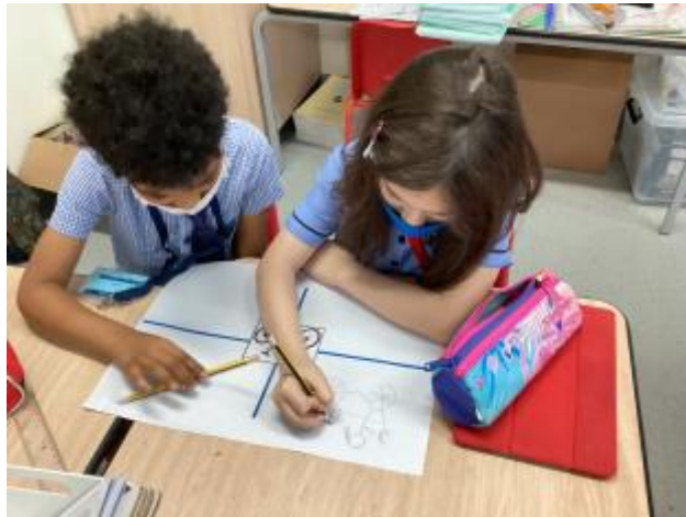
1 - Y3B