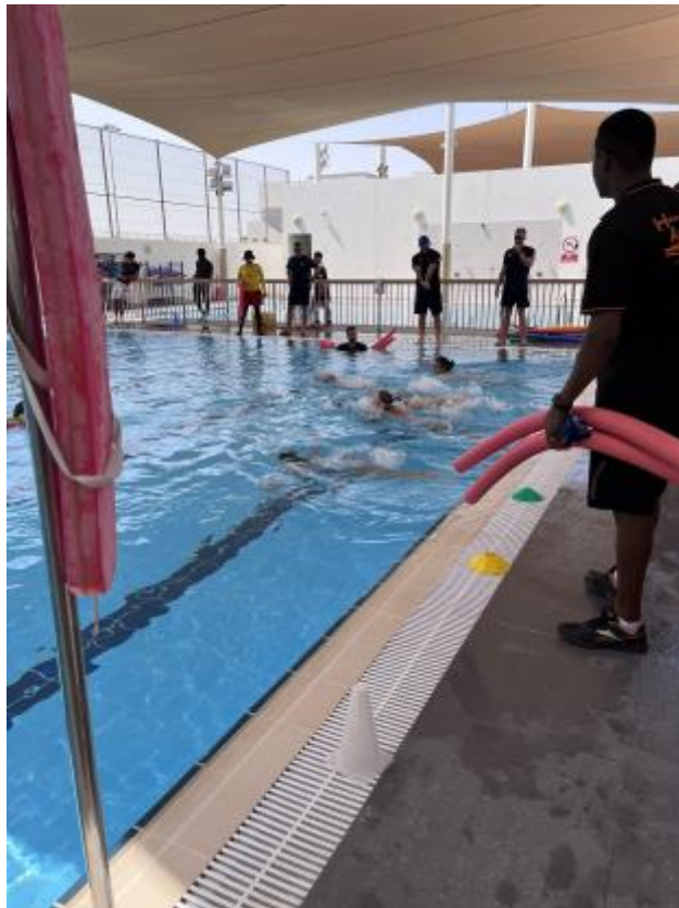
6 - Y4D