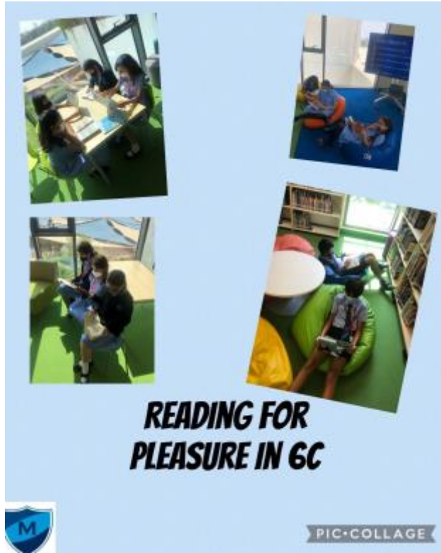
19 - Y6C