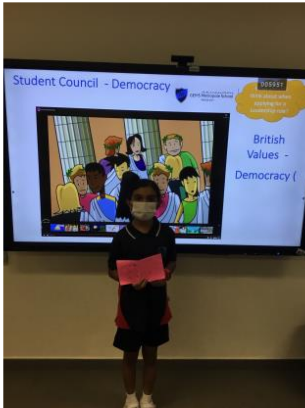
10 - Y5A