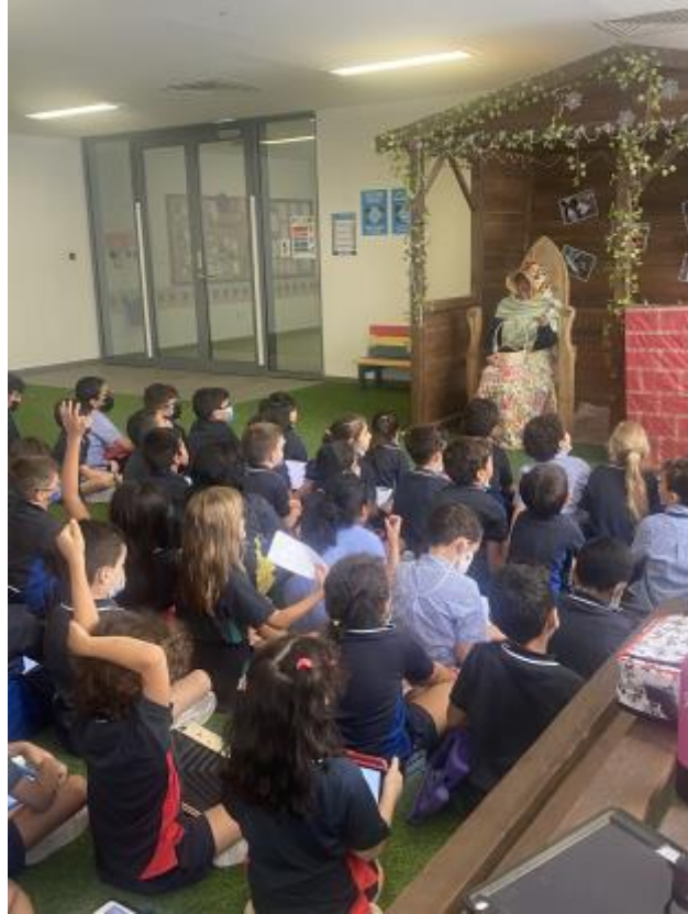
4 - Y3G