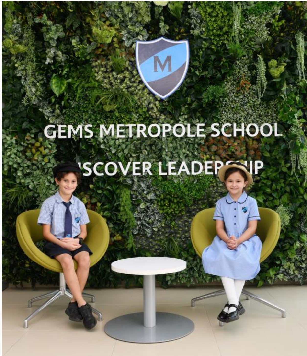
Junior Community Catch-Up 16 September 2022