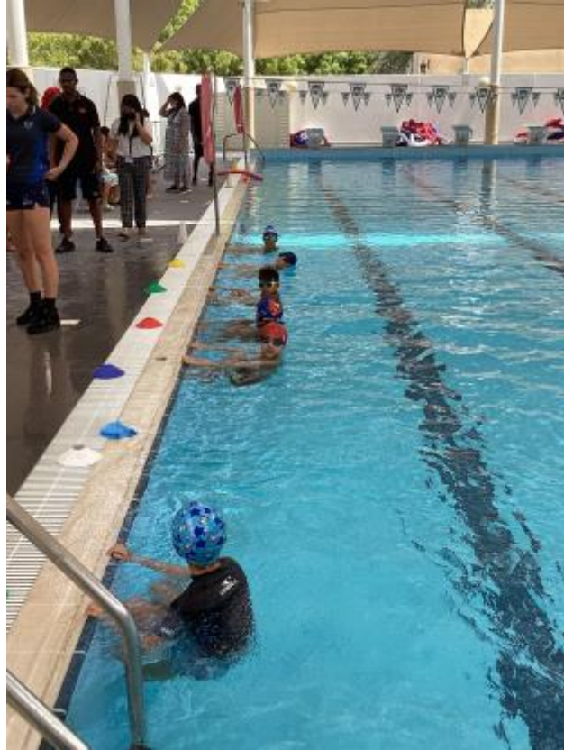
7 - Y4E