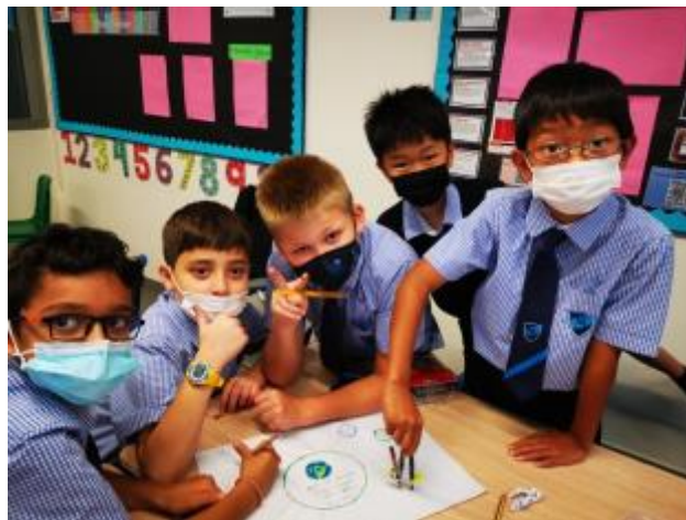
11 - Y5B