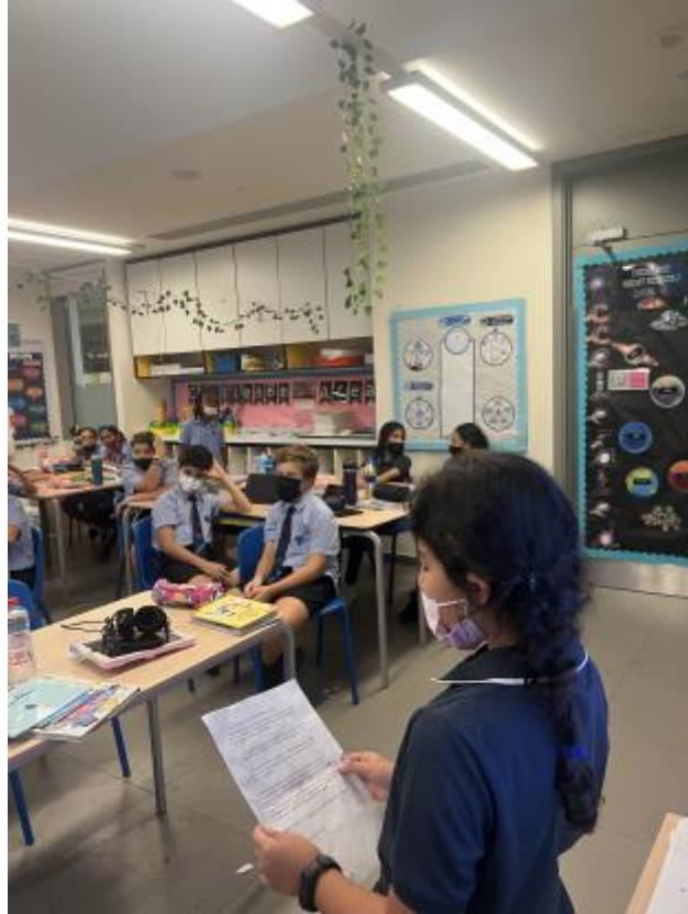
21 - Y6H