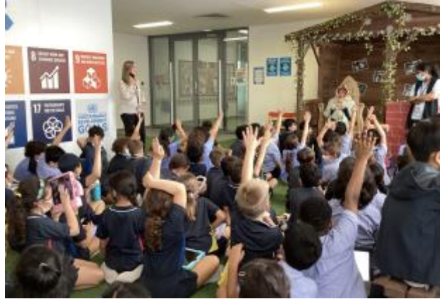
2 - Y3C