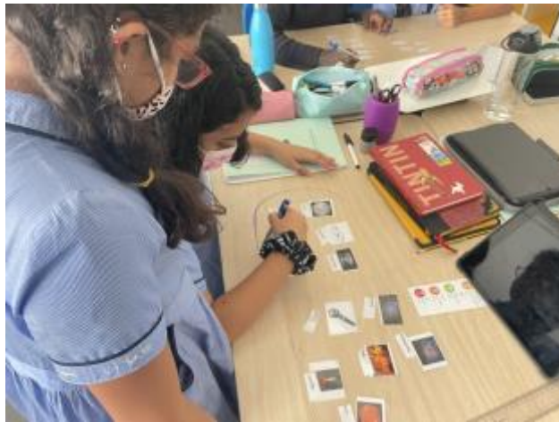
13 - Y5F