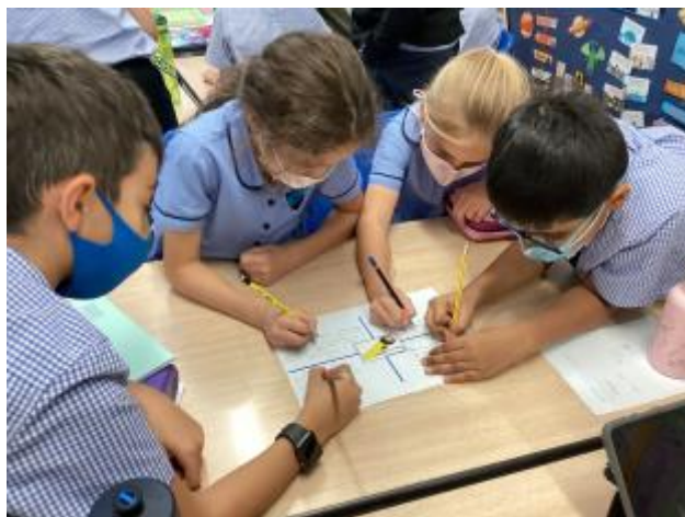
14 - Y5H