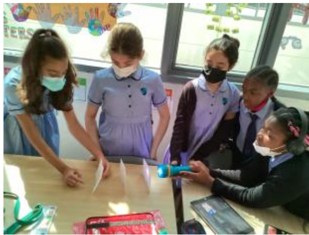
20 - Y6D