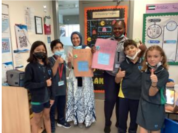
16 - Y5K