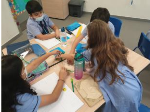
5 - Y4A