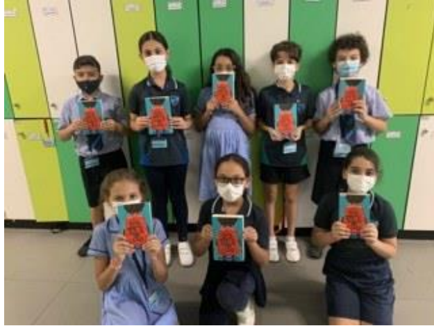
12 - Y5E