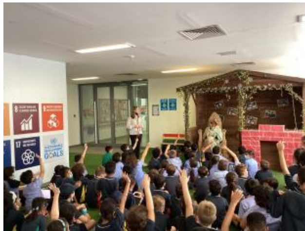
3 - Y3E