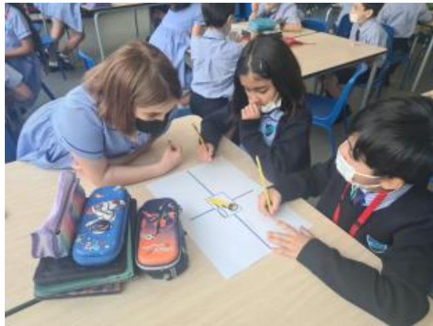
8 - Y4H