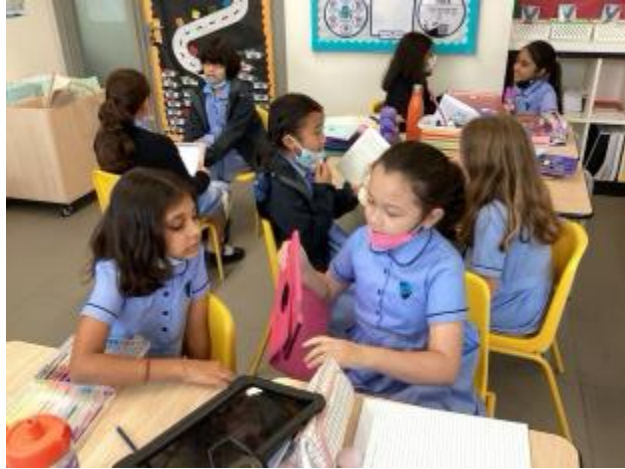
15 - Y5J