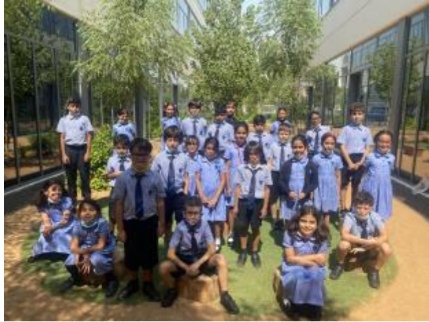
9 - Y4K