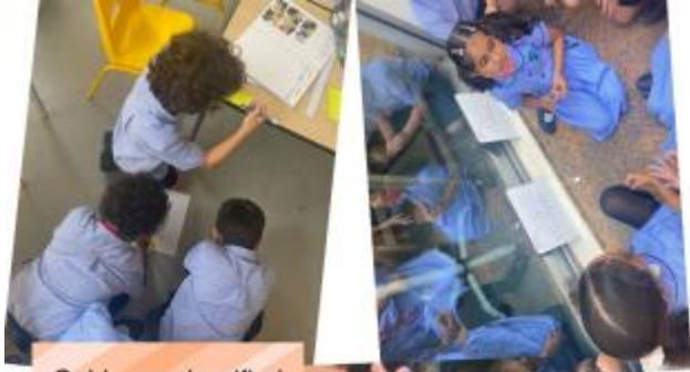
Gold - we classified rocks into man made or natural